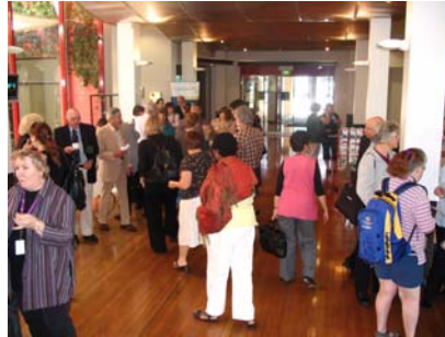
The crowd at CMAG

As always the week started with International Tenants' Day, and a public holiday in the ACT.